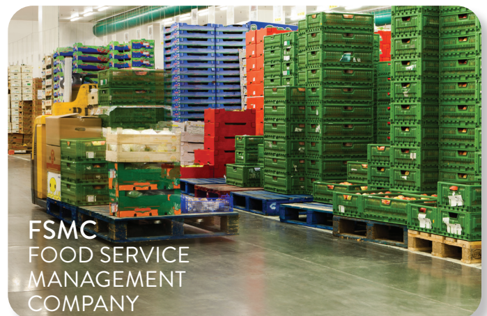
FSMC FOOD SERVICE MANAGEMENT COMPANY