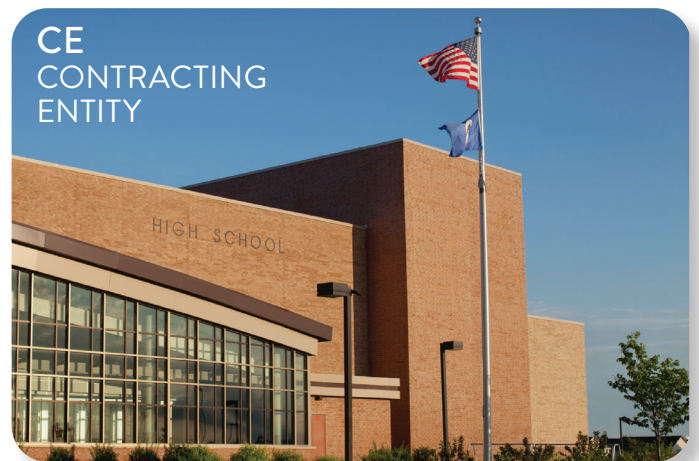
CE CONTRACTING ENTITY